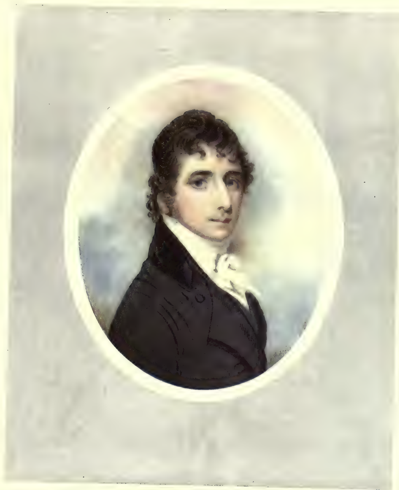
HENRY TUFTON, ELEVENTH AND LAST EARL OF THANET (1775-1849) BY RICHARD COSWAY, R.A.